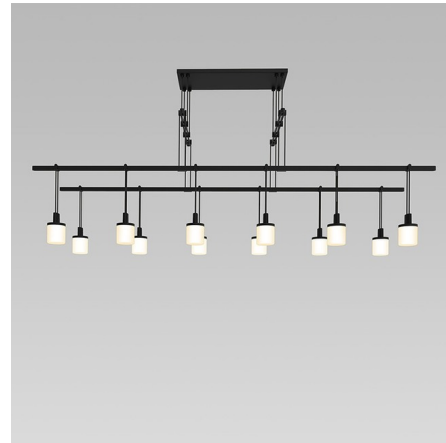
Shown in satin black

Parallel Power Bars, set in tandem, form a broad linear volume. Available with a Satin Black finish. ETL and UL listed. Luminaire 1: 12 x Drums Transformer Location: Outlet Box