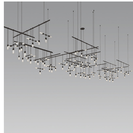
Shown in satin black / etched glass

The Suspenders Gallery Matrix Pendant with Chiclets is an intricate web of texture and interest. Four tiers of interconnected power bars support suspended LED etched glass chiclet luminaires, forming an orderly, captivating composition across your space. This configuration is made up of 35 single etched chiclet luminaires and 43 three-light etched chiclet cluster luminaires. Note: Two transformers are included, to be installed in a remote accessible location.