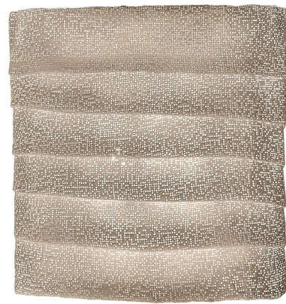
Shown in stainless steel / white

The Kala Wall Sconce is a delicately handmade lamp constructed from painted stainless steel mesh. The inspiration from the lamp comes from the irregular and ever changing lines in the sand of large dunes which are created from folding the mesh to create horizontal lines.