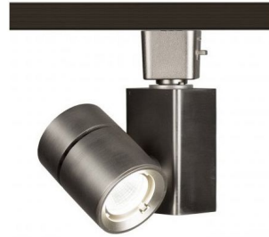
Shown in brushed nickel