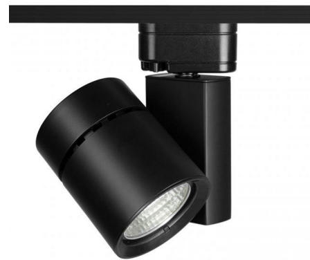
Shown in black