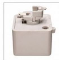
J2 System Adapter