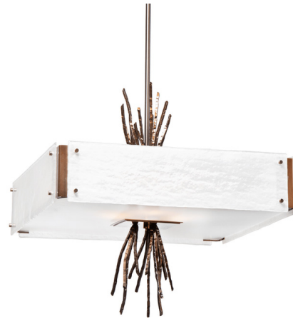
Shown in oil rubbed bronze / ivory wisp

The Ironwood Square Chandelier brings a contemporary, organic vibe to your interior space. Hand textured kiln fused glass panels are complemented by steel branches, adding a hint of the outdoors to your room. Length adjustable in 3 inch increments. Canopy: 6 inch diameter.