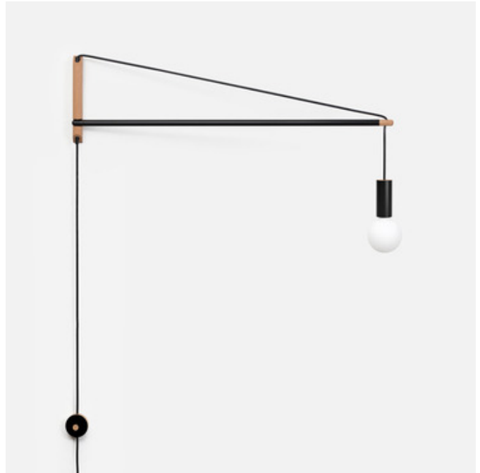
Shown in: Black

The Crane Swing Arm Wall Light pivots 180 degrees with a 20 foot cord tension cantilevered design. The light can be set to any length by simply feeding the cable through the pivoting rod. A perfect solution for modular lighting in any space. Available in White or Black. Includes in-line dimmer switch. Handmade in the USA.