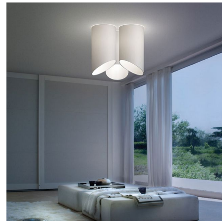
Shown in white / white / white

Pank Tube Ceiling Light Fixture was created by obliquely cutting the end of the cylindrical fabric lampshade in order to produce an asymmetry that would bend the light and enable the user to project and modulate it as required. Features a White metal finish matched with fabric lampshades in a variety of colors. Available in a 7, 9, 12 and 20 inch diameter option. 7 Inch: One 40 watt, 120 volt A19 medium base incandescent bulb is required, but not included. 7.1 inch diameter x 31.5 inch height. 9 Inch: One 100 watt, 120 volt A19 medium base incandescent bulb is required, but not included. 9.1 inch diameter x 10.6 inch height. 12 Inch: One 100 watt, 120 volt A19 medium base incandescent bulb is required, but not included. 11.8 inch diameter x 22.5 inch height. 20 Inch: 19.7 inch diameter x 33.5 inch height. Four 60 watt, 120 volt A19 medium base incandescent bulbs are required, but not included.