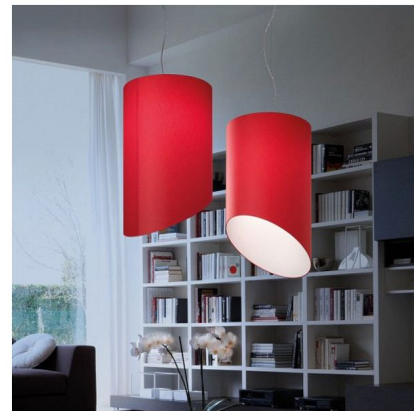
Shown in white / red / white

Pank Pendant was created by obliquely cutting the end of the cylindrical fabric lampshade in order to produce an asymmetry that would bend the light and enable the user to project and modulate it as required. Features a White metal finish matched with a variety of fabric lampshades.