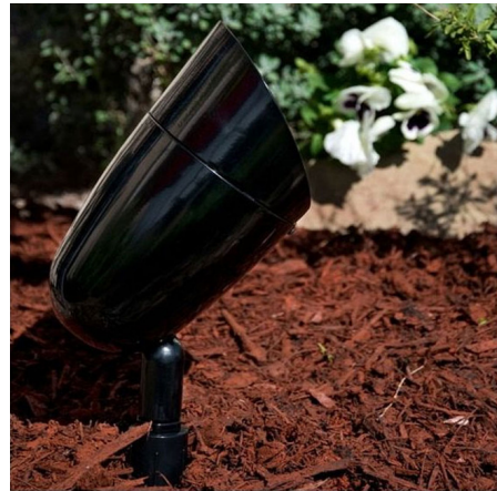
Shown in black

BU3 Bullyte Accent Light is made of Ultem high performance polymer composite in Black finish. Features fully adjustable swivel arm with vibration-proof locking teeth. Silicone gasketing and Stainless Steel 300 series fasteners. Clear tempered glass affixed at 10 degree angle for natural cleaning. Includes .5 inch NPS male threads to screw onto accessory mounting stake or junction box, sold separately. Optional mounting and optical accessories sold separately.