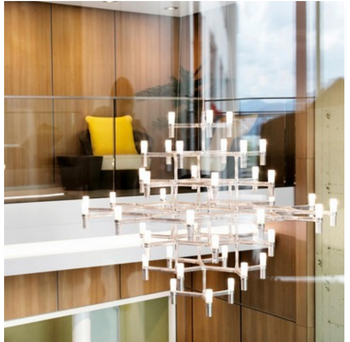
Shown in: Polished Aluminum / Sandblasted Glass

Crown Magnum Pendant, designed by Jehs and Laub, is a modular structure featuring forty-two Sandblasted glass diffusers with a Polished Aluminum, Gold Plated, Matte White, Matte Black, Black Painted, or Gold Plated. Comes with 137 inches of cable to customize length.