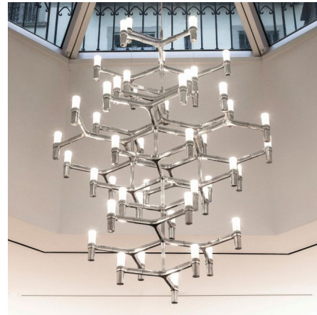
Shown in polished aluminum / sandblasted glass

Crown Summa Pendant Chandelier is a modular structure featuring forty-eight Sandblasted glass diffusers with a Polished Aluminum, Gold Plated, or painted Matte White, painted, Matte Black, or painted Gold. Can be dual switched. See attached manufacturer reference for dimmer compatibility. Accessory G9 LED kit sold separately.