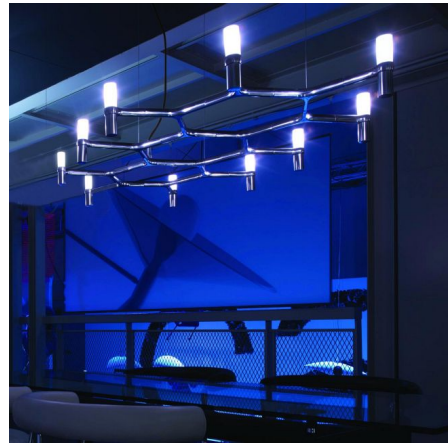
Shown in polished aluminum / sandblasted glass

Crown Plana Pendant is a modular structure featuring ten Sandblasted glass diffusers with a Polished Aluminum, Gold Plated, Black Plated, or painted Matte White, painted, Matte Black, or painted Gold. Optional G9 LED kit sold separately.