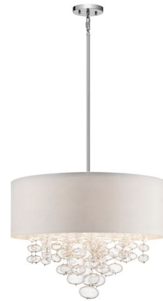
Shown in chrome / white