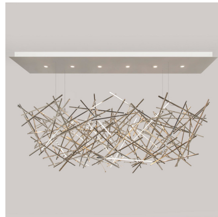
Shown in nickel

Criss-Cross Chandelier, designed by Ridgely Studio Works, was created from a genuine desire to blend art with lighting. It is a sculptural piece that is composed of cut steel rods carefully arranged and welded in a seemingly random pattern and lit from a canopy mounted above the fixture. ETL listed. Requires 3/4 inch thick plywood (or similar) blocking secured into ceiling prior to installation (see attached blocking diagram).