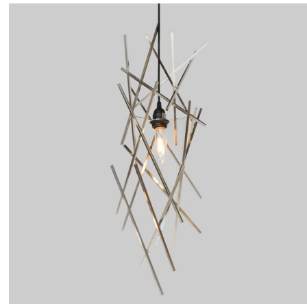
Shown in nickel plated / black cord

PRODUCT DIMENSIONS . . . . . Cord Length: 144"