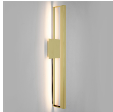
Shown in brushed brass

Bar Wall Light, designed by Ridgely Studio Works, is a simplistic elegant addition to any room in your home. The glow from the inside diffuser washes your area beautifully. Built from cold rolled steel in Brushed Brass, Blackened Steel, Satin Nickel, Gloss White, Blackened Bronze, or Polished Nickel finishes. Available in small, medium, and large sizes. ADA compliant. CSA listed. ETL listed.