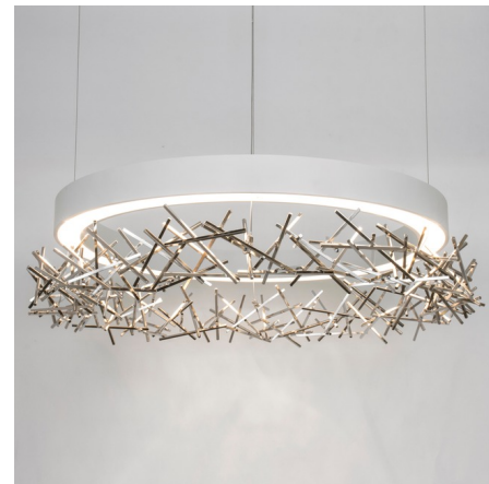
Shown in nickel plated

PRODUCT DIMENSIONS Cord/Cable Length: 48" LAMP COLOR 3000K LUMENS/WATT 75.66 LUMINOUS FLUX 3102 lumens