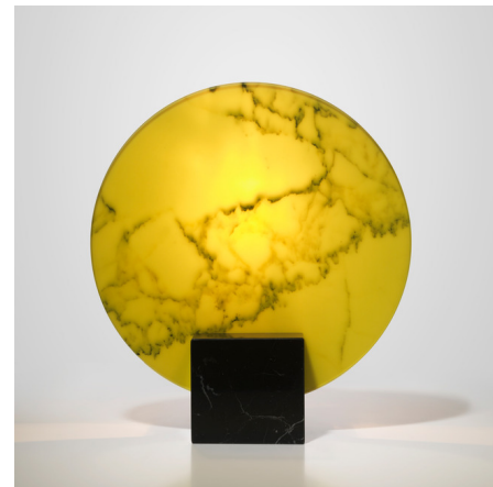
Shown in black / carrara marble / acid yellow

Acid Marble Table Lamp features a layer of white Carrara Marble and Acid Yellow tinted glass that are sandwiched together to form an illuminated circular diffuser for this sculptural table Lamp. Set into a solid Black Nero marquina marble base, the veins of the Carrara marble are visible through the glass allowing the marble to appear yellow, giving this very classic material a playful twist. One 40 watt, 120 volt A19 Medium base incandescent bulb is required, but not included. 15.16 inch width x 16.54 inch height x 8.27 inch depth.