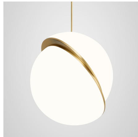
Shown in brushed brass / opal

LAMP LIFE . . . . . 10000 hours COLOR RENDERING . . . . . 82 CRI LAMP COLOR . . . . . 2800K LUMENS/WATT . . . . . 100.00 LUMINOUS FLUX . . . . . 1100 lumens