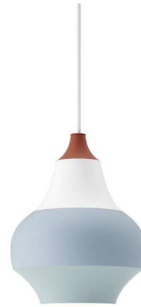
Shown in white / copper top multi color

Inspired by the colors and forms in Copenhagen's Tivoli Gardens, the Cirque Pendant provides downward, glare-free soft light thanks to the white lacquered inner reflector. Available in a variety of sizes and color schemes to suit any decor.