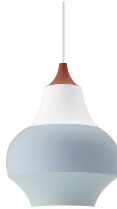
Shown in white / copper top multi color

Inspired by the colors and forms in Copenhagen's Tivoli Gardens, the Cirque Pendant provides downward, glare-free soft light thanks to the white lacquered inner reflector. Available in a variety of sizes and color schemes to suit any decor.