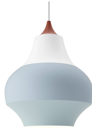
Shown in white / copper top multi color

Inspired by the colors and forms in Copenhagen's Tivoli Gardens, the Cirque Pendant provides downward, glare-free soft light thanks to the white lacquered inner reflector. Available in a variety of sizes and color schemes to suit any decor.