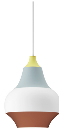
Shown in white / yellow top multi color

Inspired by the colors and forms in Copenhagen's Tivoli Gardens, the Cirque Pendant provides downward, glare-free soft light thanks to the white lacquered inner reflector. Available in a variety of sizes and color schemes to suit any decor.