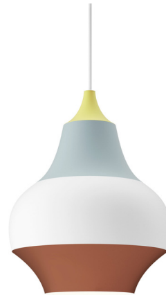
Shown in white / yellow top multi color

Inspired by the colors and forms in Copenhagen's Tivoli Gardens, the Cirque Pendant provides downward, glare-free soft light thanks to the white lacquered inner reflector. Available in a variety of sizes and color schemes to suit any decor.