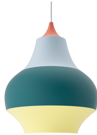
Shown in white / red top multi color

Inspired by the colors and forms in Copenhagen's Tivoli Gardens, the Cirque Pendant provides downward, glare-free soft light thanks to the white lacquered inner reflector. Available in a variety of sizes and color schemes to suit any decor.