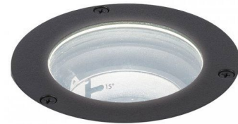
Shown in bronze on aluminum / clear