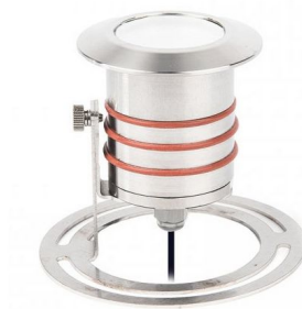
Shown in stainless steel

LAMP LIFE 70000 hours BEAM SPREAD Spot COLOR RENDERING 85 CRI LAMP COLOR 3000K LUMENS/WATT 42.50 LUMINOUS FLUX 170 lumens