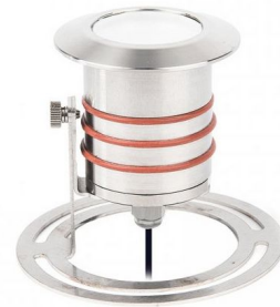
Shown in stainless steel