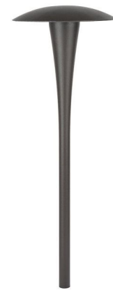
Shown in bronze on brass

LAMP LIFE 60000 hours BEAM SPREAD Flood COLOR RENDERING 90 CRI LAMP COLOR 2700K LUMENS/WATT 25.86 LUMINOUS FLUX 150 lumens