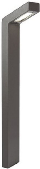
Shown in: Bronze

Linear Outdoor Path Light features a sleek linear design that blends seamlessly into pathways while providing soft, directional illumination. Translucent lens provides uniform light distribution. Note: Required low voltage magnetic power supply and optional accessories sold separately. Includes ST9 mounting stake, 6 foot lead wire, and direct burial gel filled wire nuts.