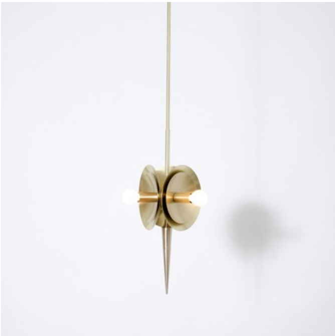
Shown in: Satin Brass

The Concentric Pendant by studio PGRB, is inspired by the geometric principle that two or more objects are said to be concentric when they share the same center or axis. Circular shades feature their light source in the center of each shade. Available in Satin Brass, Natural Brass, Matte Black and Polished Nickel finishes with 3, 6, or 9 lights. With every fixture being handmade, there may be slight variations in build. UL listed.