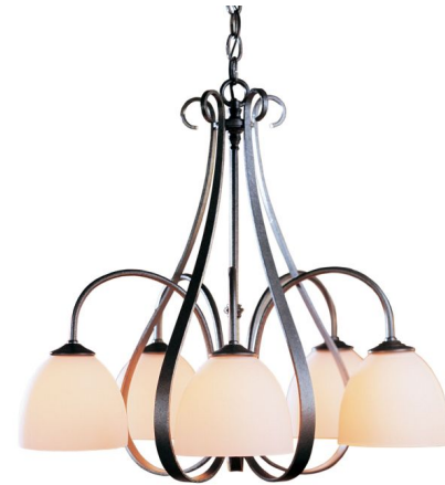
Shown in natural iron / opal

The Sweeping Taper 5 Arm Curved Chandelier brings a graceful beauty to your interior space. Hand shaped steel ribbons are complemented by tulip shaped glass diffusers directing light downward. Canopy: 5 inch diameter. Slope ceiling adaptable. Handcrafted to order by skilled artisans in Vermont, USA. Lifetime Limited Warranty when installed in residential setting.