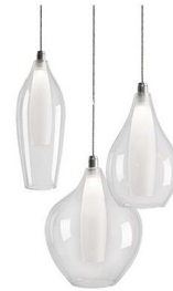
Shown in chrome / clear

PRODUCT DIMENSIONS . . . . . Maximum Adjustable Height: 131" LAMP LIFE . . . . . 50000 hours COLOR RENDERING . . . . . 90 CRI LAMP COLOR . . . . . 3000K LUMENS/WATT . . . . . 272.50 LUMINOUS FLUX . . . . . 545 lumens