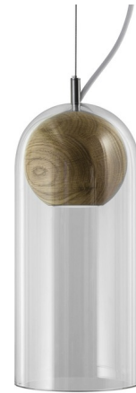
Shown in oak / clear

Cloak Pendant uses a premium Clear glass dome to encase a beautifully crafted sphere. The natural beauty of the Walnut, Oak, or stained Ash in Black or White globe is enhanced by the thick layer of glass draped over them - the glass itself seems to hover weightlessly over the globe. The light within the sphere omits an elegantly powerful yet dispersed glow, making these lights both beautiful and incredibly effective. Includes 6.5 feet of cable to customize length. 5 inch diameter canopy. Made in the UK.