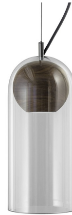
Shown in walnut / clear

PRODUCT DIMENSIONS . . . . . Cord Length: 78"