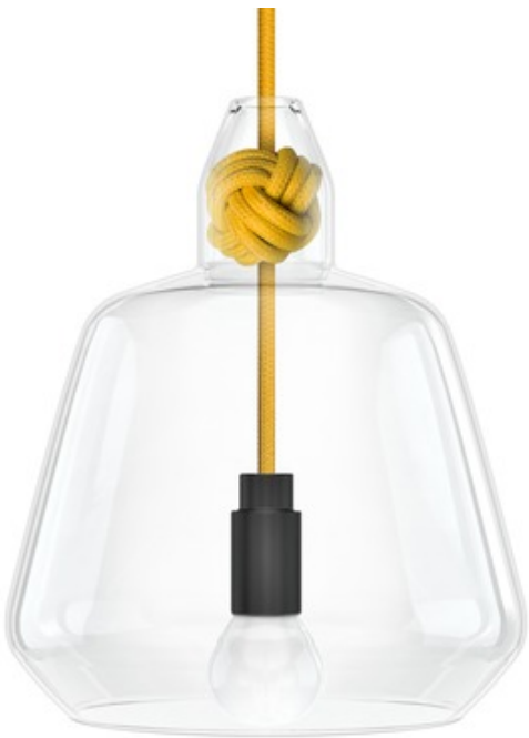
Shown in: Yellow / Clear

The Knot Large Pendant designed by Andy Vernal and Chris Vernal, features hand blown Clear glass supported by a monkey fist knot. The knots are tied from brightly colored cable in Grey, Blue, Red, Black, White, Orange, Yellow, Mid Blue, Navy, Mint, Dusky Pink, or Green. This piece is versatile and can be displayed in an illuminating cluster or line, or alone creating a single ambient glow. Whichever way you choose to display them, the Knot Lamps will subtly draw attention with their enigmatic aura. Includes 6.5 feet of colored cable to customize length and a 5 inch diameter White canopy. Prop 65. Made in the UK. NOTE: Fixture requires an E14 socket adapter to convert for E12 base bulb, sold separately.