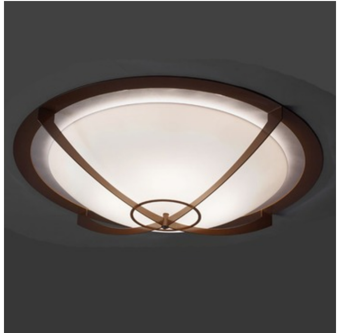
Shown in: Medieval Bronze / Opal

Synergy 0480 Damp Ceiling Flush Light features an Opal diffuser with a Medieval Bronze finish. Available in small and large sizes. One 20 watt A19 LED bulb is included. Damp location rated. Made in the USA. UL and cUL listed. Small: 31 inch width x 7.5 inch height. Large: 39 inch width x 9 inch height.