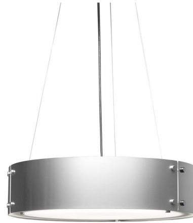
Shown in chrome / opal

PRODUCT DIMENSIONS . . . . . Max Overall Height: 96" COLOR RENDERING . . . . . 80 CRI LAMP COLOR . . . . . 3000K LUMENS/WATT . . . . . 154.01 LUMINOUS FLUX . . . . . 7223 lumens