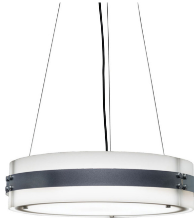
Shown in opal / dark iron / opal

PRODUCT DIMENSIONS . . . . . Max Overall Height: 96" COLOR RENDERING . . . . . 80 CRI LAMP COLOR . . . . . 3000K LUMENS/WATT . . . . . 154.01 LUMINOUS FLUX . . . . . 7223 lumens