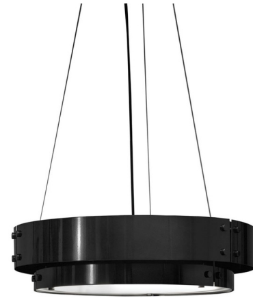
Shown in black pearl / opal

PRODUCT DIMENSIONS . . . . . Max Overall Height: 96" LAMP COLOR . . . . . 3000K LUMENS/WATT . . . . . 154.01 LUMINOUS FLUX . . . . . 7223 lumens