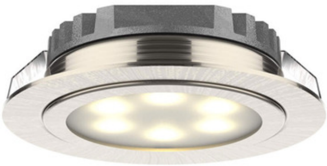
Shown in: Satin Nickel / Frosted

The Duo-Puck 12V Puck Light is designed for recessed applications with smooth 360 degree wide spread. Ideal for accent lighting inside or under any cabinet, shelf, or display. Includes 12 inch input lead with quick connector, 24 inch interconnection harness, and frosted glass lens. Required LED driver and optional mounting accessories sold separately.