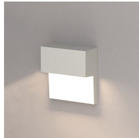
Shown in white / frosted

LAMP LIFE . . . . . 36000 hours COLOR RENDERING . . . . . 90 CRI LAMP COLOR . . . . . 3500K LUMENS/WATT . . . . . 56.67 LUMINOUS FLUX . . . . . 340 lumens