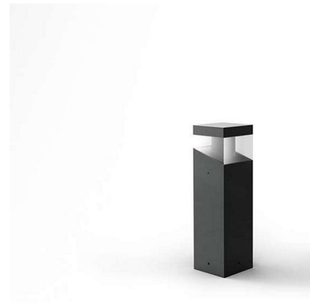
Shown in anthracite grey

LAMP LIFE . . . . . 36000 hours COLOR RENDERING . . . . . 80 CRI LAMP COLOR . . . . . 3000K LUMENS/WATT . . . . . 33.60 LUMINOUS FLUX . . . . . 504 lumens