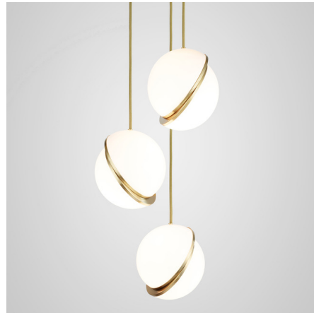
Shown in brushed brass / opal

The Mini Crescent Multi Light Pendant is a miniature chandelier version of the popular Crescent Light. The illuminated sphere is sliced asymmetrically in half to reveal a crescent-shaped brushed brass fascia. Available with three or five lights in an opal acrylic with brushed brass finish. CE and cUL listed.