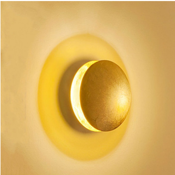
Shown in: Gold Leaf

The Lederam W Wall Sconce features sinuous, curved lines for a contemporary geometric expression. The LED light source is housed in between two aluminum discs with a metallic Gold or Copper Leaf finish that reflects light backwards onto the wall to create a striking halo effect. The front disc's position can be adjusted to change to angle of the light cast from the sconce. Includes white or black mounting plate to cover standard US junction box.