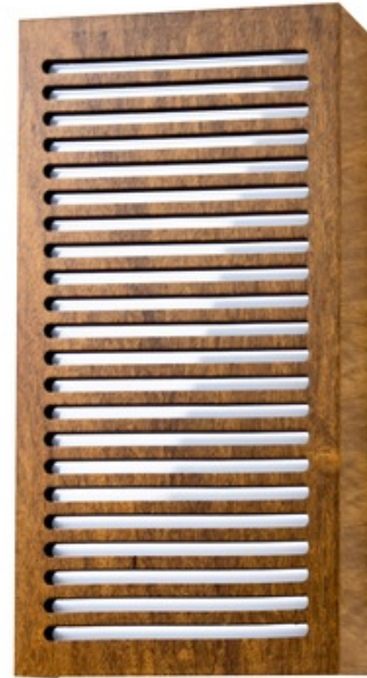
Shown in: Imbuia / White Acrylic

The Clean Line Wall Sconce features a Natural Wood Veneer Frame with an inner White Acrylic diffuser. Integrated LED Module version is dimmable via low-voltage electronic, TRIAC, or 0-10V dimming.