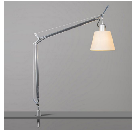
Shown in aluminum / parchment paper

COLOR RENDERING . . . . . 90 CRI LAMP COLOR . . . . . 2900K LUMENS/WATT . . . . . 23.20 LUMINOUS FLUX . . . . . 1392 lumens