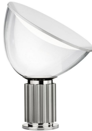
Shown in silver / white

COLOR RENDERING . . . . . 93 CRI LAMP COLOR . . . . . 2700K LUMENS/WATT . . . . . 73.86 LUMINOUS FLUX . . . . . 2068 lumens