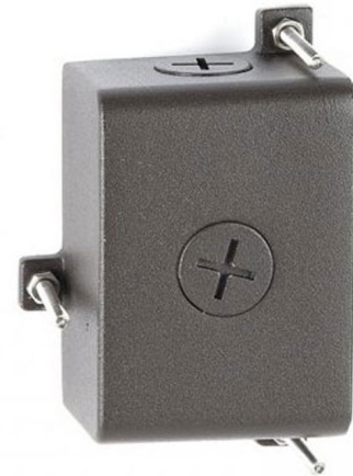
Shown in bronze on aluminum

The Tree Mount Junction Box Landscape Accessory is an aluminum box with two 1/2 inch NPT threaded holes with stainless steel mounting screws included. Designed for use with WAC Lighting landscape lighting products.